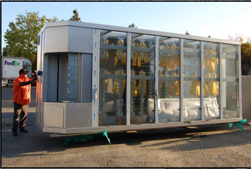
MGI's new tool matrix arrives. 2 units are now in the shop with each matrix capable of holding 495 tools.