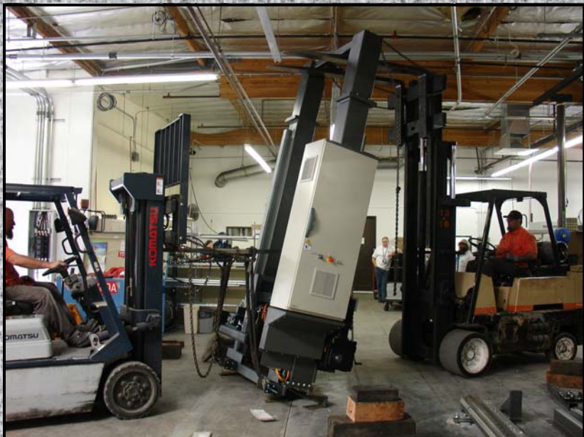
Dueling forklifts position the new rail guided vehicle for MGI's new palletized machining system.