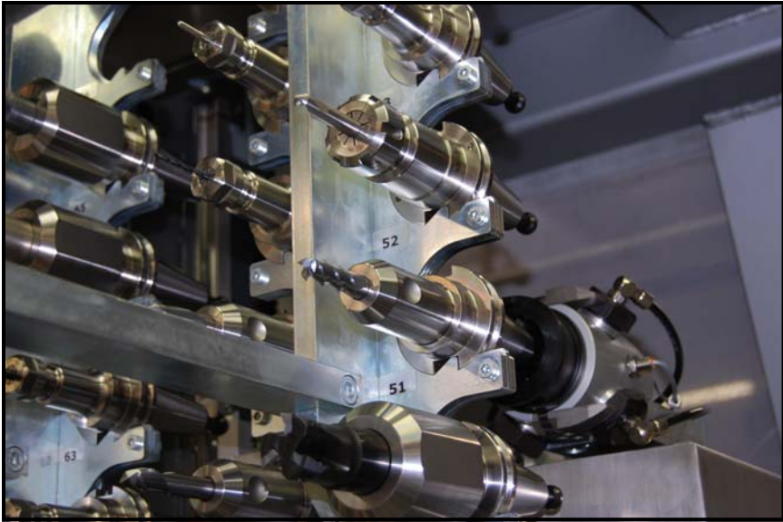
Tools are in the new Toyota FH450.