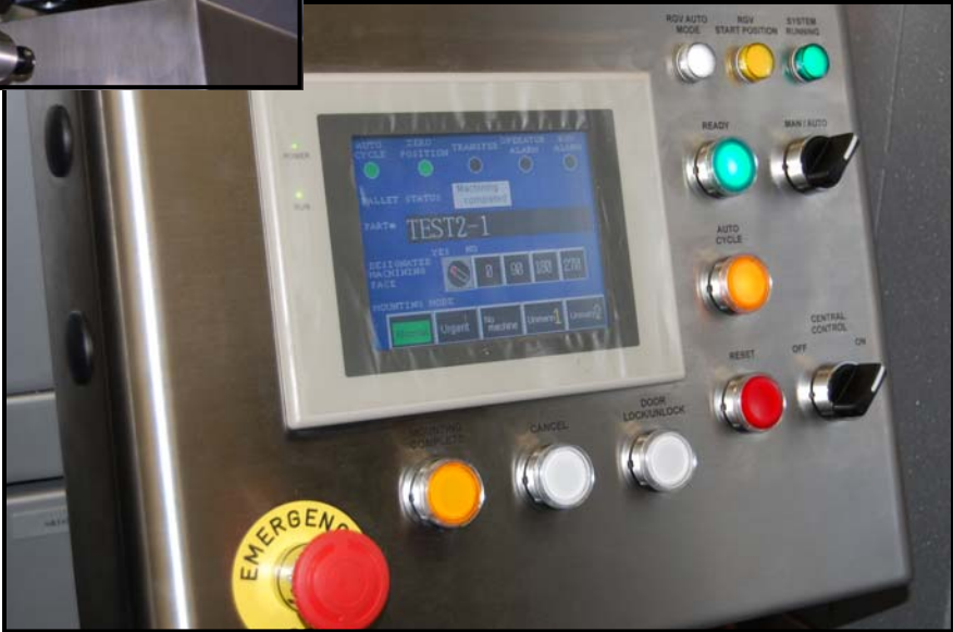
Ready for the initial run.