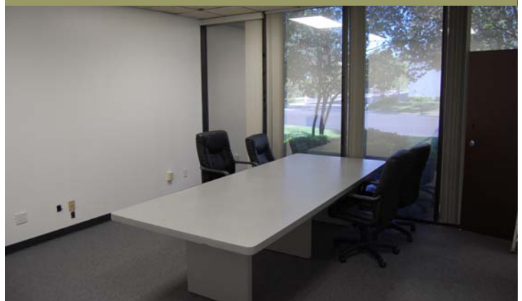
MGI'S long awaited conference room is shaping up.