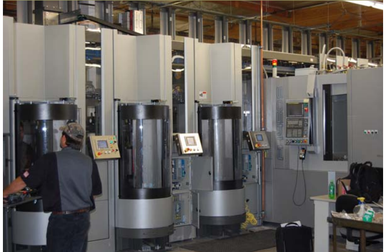
Three loading stations for the Toyota FH450S manufacturing cell.